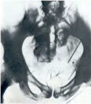
Pelvic X-ray of Fish revealing needles shoved inside his groin.